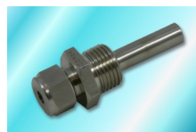
Pockets / Thermowells